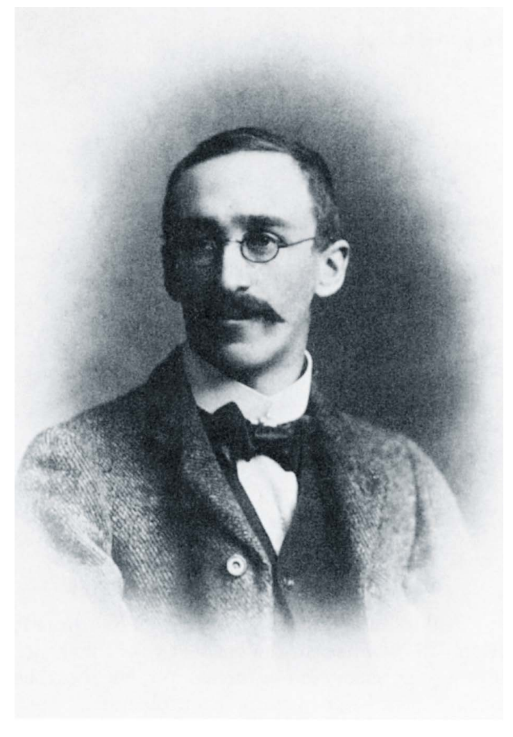
Figure 1 W. S. Gosset, 1899.

In July 1905, during a vacation in England, Gosset was invited to the summer residence of Karl Pearson, already established statistics. They had a long discussion that Gosset considered very useful; later he stated that Pearson "was able in about half an hour to put me in the way of learning the practice of nearly all the methods then in use".